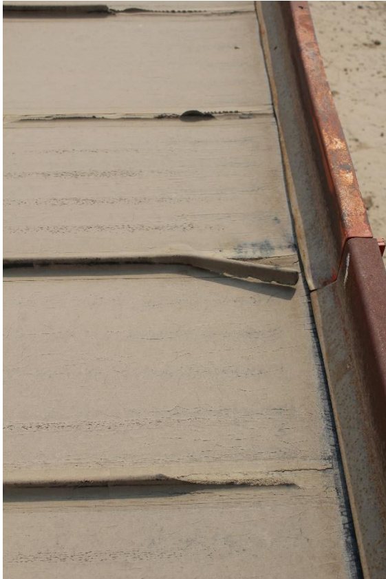
Photo 1. Worn flights should be replaced to properly carry potatoes up conveyors. These flights minimize rollback and bruising of potatoes.

Below are just a few examples of some of the most common areas of wear on harvesting and handling equipment.