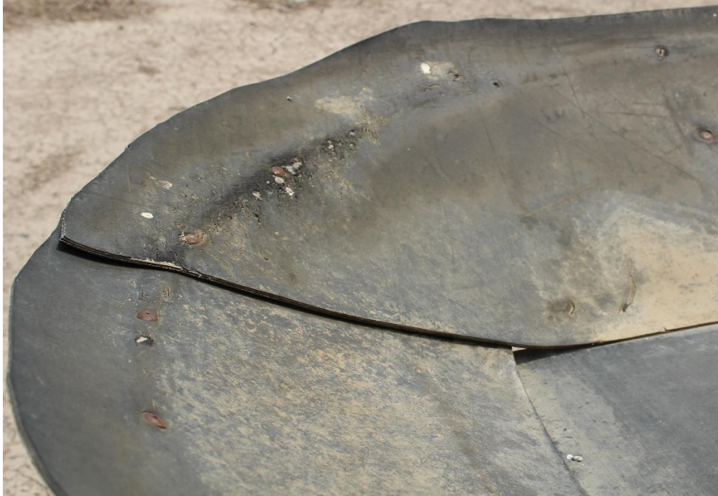
Photo 2. Wear on stinger baskets exposes metal surfaces for potatoes to hit and easily become damaged. It takes less force to bruise potatoes if they are hitting metal compared to belting or other cushioning materials (See figure 1). Replace all worn padding before starting to harvest the new crop.