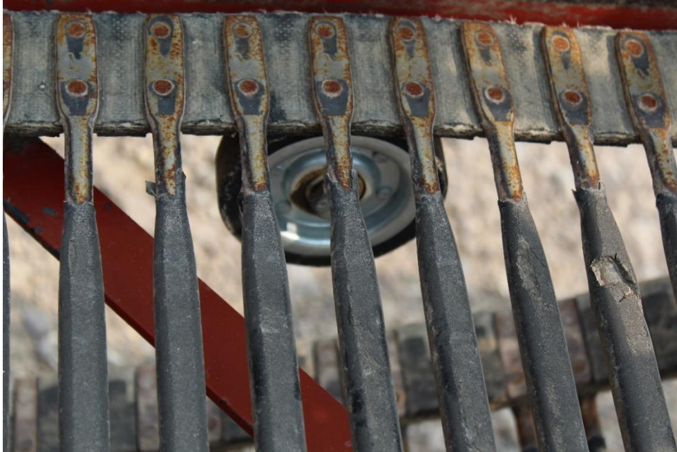
Photo 5. Replace worn padding on chain conveyors. Exposed metal on the chains indicates that the padding is no longer effectively cushioning impacts. The ends of conveyors where they contact rollers are common places for excessive wear.