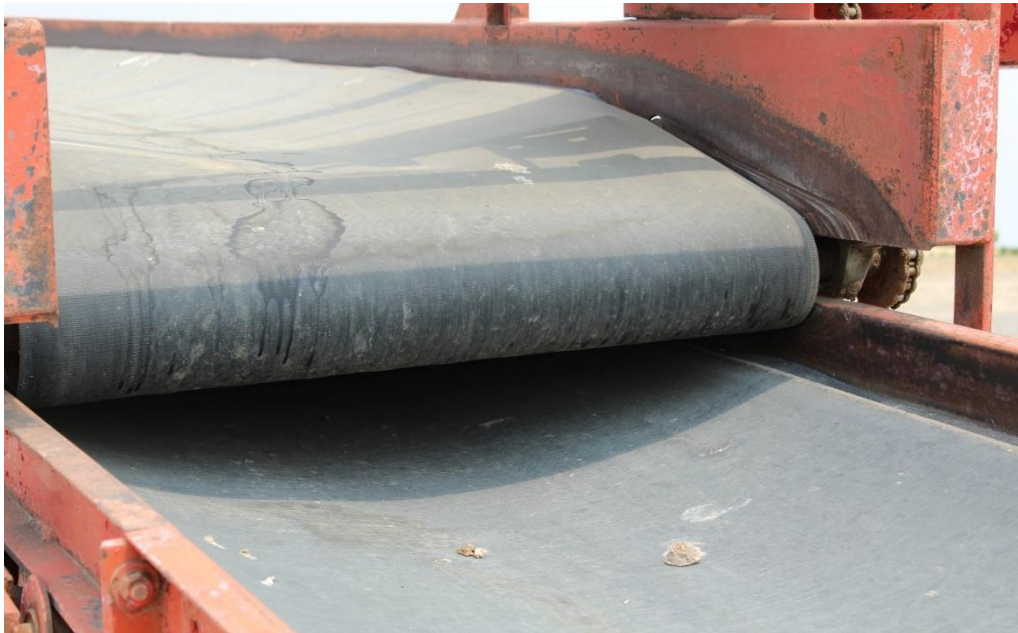
Photo 6. Cleaning equipment before harvesting the new crop is important to minimize disease carryover from one season to the next. Diseases such as bacterial ring rot can survive as dried slime on metal and other surfaces for more than a year. See http://www.cals.uidaho.edu/edComm/pdf/CIS/CIS1180.pdf for more information on cleaning equipment and storages.