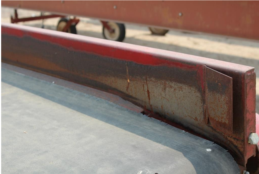
Photo 3. Don't forget to pad sidewalls and replace worn padding to avoid potatoes hitting bare metal.