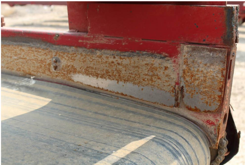
Photo 4. Noticed how shiny and worn down the metal is on the side wall in this photograph? That is from potatoes hitting and rubbing against the metal. Look for areas throughout your operation where you see shiny metal and consider adding padding to minimize the impact on potatoes.